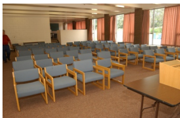
Floor Lounge 102 – up to 80pp